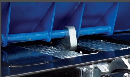
FRONT & BACK LOCKING SYSTEM