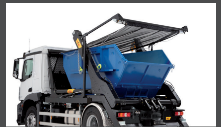
AUTO SHEETING SYSTEM