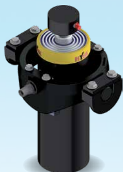
UL Range for light duty trailers and vans

Telescopic hydraulic cylinders – designed to match your application