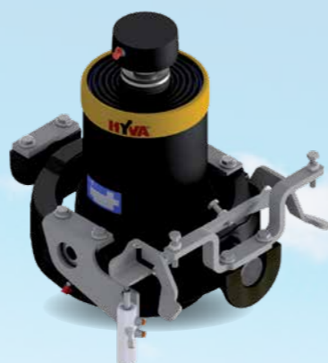
UH range for heavy duty trucks and (agri) trailers