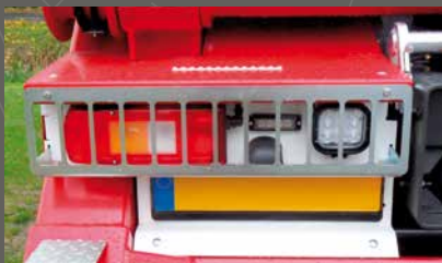
TAIL LIGHT PROTECTORS