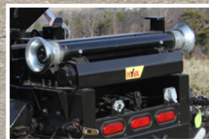
Heavy duty roller