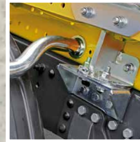
Subframe support brackets