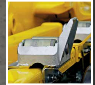
Zinc-plated container supports