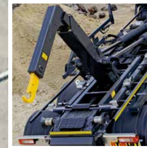
Corrosion resistant painting