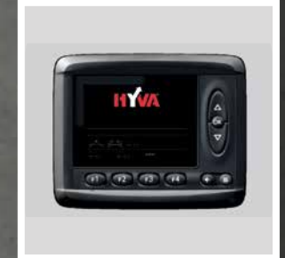
Electronic Control System (IQAN)