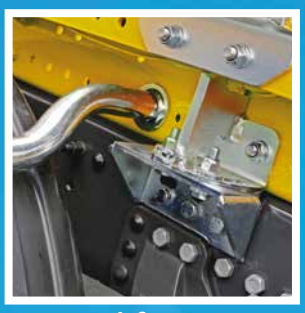
Subframe support brackets