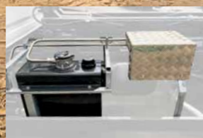
Tank + Valve